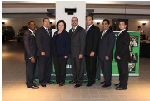
Gold Sponsor -TD Bank