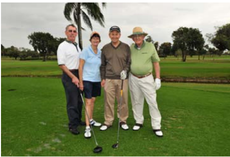
Silver Sponsor - Baptist Health Systems