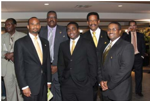
Beta Beta Lambda Alpha Phi Alpha Fraternity Inc.