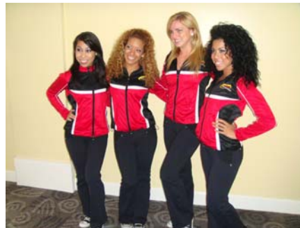
Miami Heat Dancers