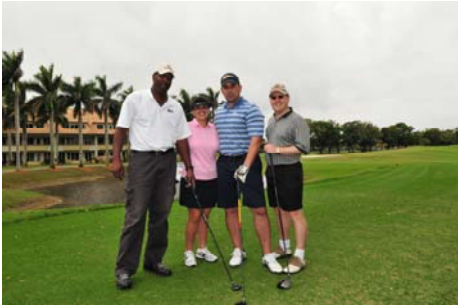
Gold Sponsor - Willis Group