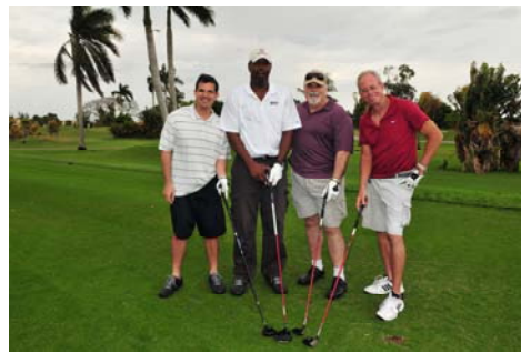
Gold Sponsor - TransPhoton Corp