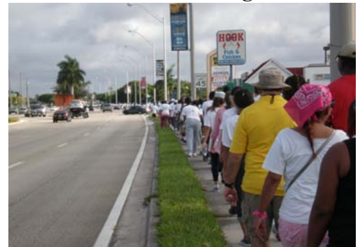
Walking along US1!