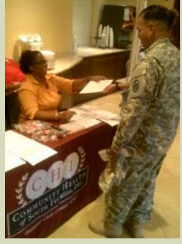
CHI attended the Multilingual Career Expo Miami 2013- Chamber of Commerce Job Fair. CHI is committed to recruiting veterans. Over the past three months, CHI has hired more than 60 new employees.