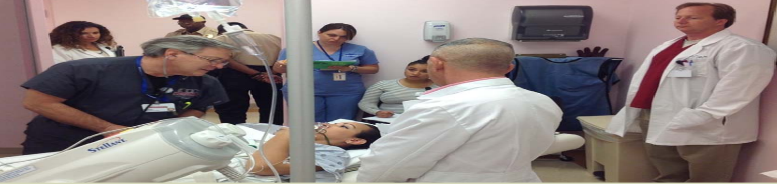
CHI staff tends to mock CT patient in a Code Blue Drill

Two to three minutes is a small window of time when that is all that you have to save a patient's life. But that is the scenario when someone has a heart attack while getting a CAT (Computer Axial Tomography Scan). That is why the staff at Community Health of South Florida, Inc. has been holding a series of Code Blue drills.