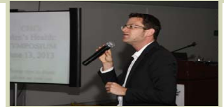
Dr. Richard Issacson was the keynote speaker focusing on keeping your brain healthy and sharp for the Men's Health Expo

When it comes to healthcare, statistics show men are 70 percent less likely to seek treatment when compared to their female counterparts. Women are 100% more likely than men to seek preventative health care. Despite our differences CHI focused its efforts on reaching both sexes by hosting health expos for men and women. Both events included routine screenings, preventative care and educational speakers.