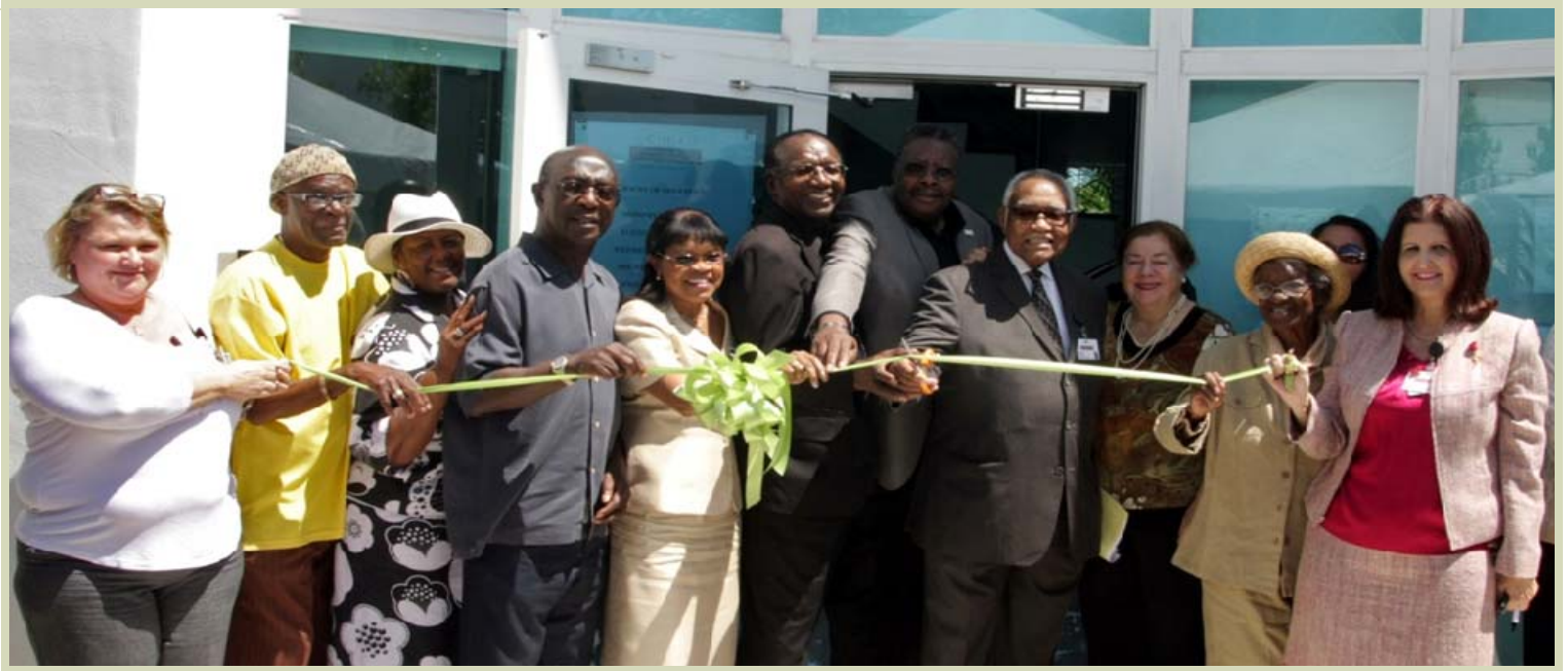
CHI leaders cut the ribbon at the grand opening ceremony of the Coconut Grove Health Center